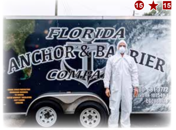
Insulation & Vapor Barrier Repairs Soft Floor Repairs & Laminate Flooring